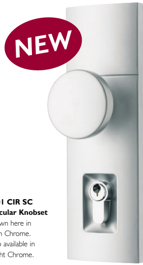
8901 CIR SC Circular Knobset Shown here in Satin Chrome. Also available in Bright Chrome.