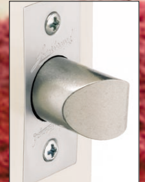
Right: Extra security with 20mm throw deadbolt