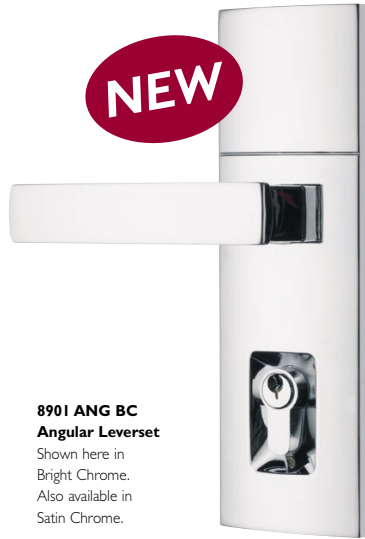
8901 ANG BC Angular Leverset Shown here in Bright Chrome. Also available in Satin Chrome.