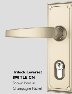
Trilock Leverset 890 TLE CN Shown here in Champagne Nickel.