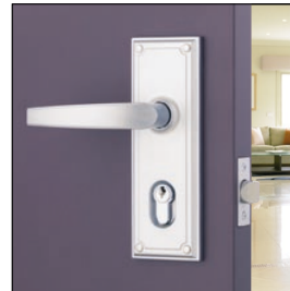
Trilock Leverset shown here in Satin Chrome

Featuring the unique 3 in 1 Trilock technology of lockset, deadbolt and passage functions all combined into the one set, the Trilock Traditional series offers the option of elegant perimeter design lines on the escutcheon plates and handles, adding style, class and appeal to the exterior doors of the home.