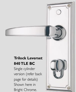
Trilock Leverset 840 TLE BC Single cylinder version (refer back page for details) Shown here in Bright Chrome.