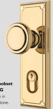
Trilock Knobset 890 TRI BG Shown here in Bright Goldtone.

The Trilock Traditional product range is available in the following finishes: