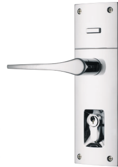
Interior view showing easy locking button.