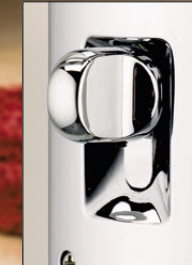
Left: Single Cylinder with inside turnbutton also available. Quote 8401 when ordering (refer back page for details).

The concealed fixing enhancement on the external escutcheon plate provides a smooth and modern look.