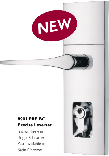
8901 PRE BC Precise Leverset Shown here in Bright Chrome. Also available in Satin Chrome.

Gainsborough now adds Trilock Contemporary